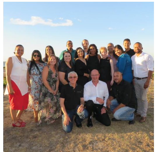
The One Year Diploma students at the graduation ceremony.