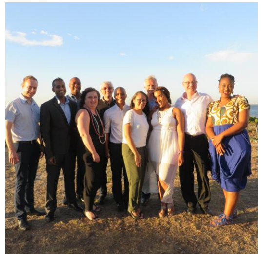
The Advance Packaging Diploma students at the graduation ceremony during the AGM.