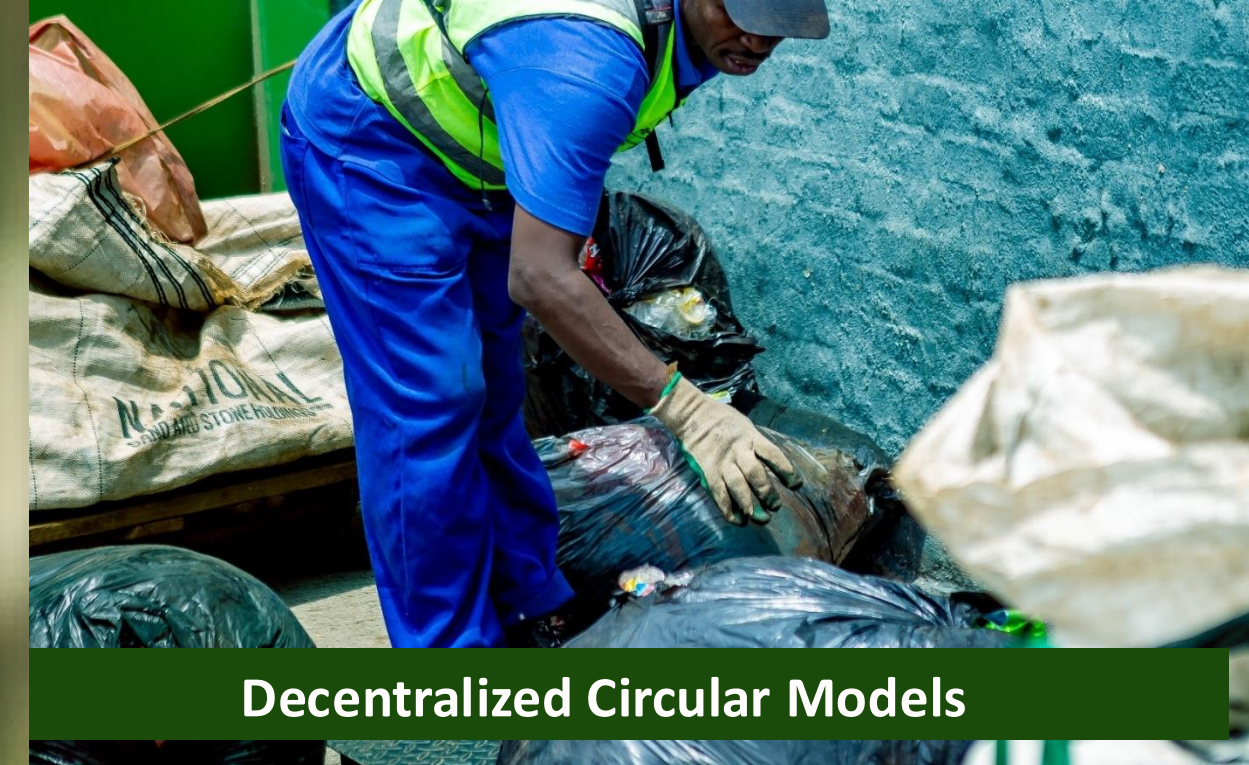
Decentralized Circular Models