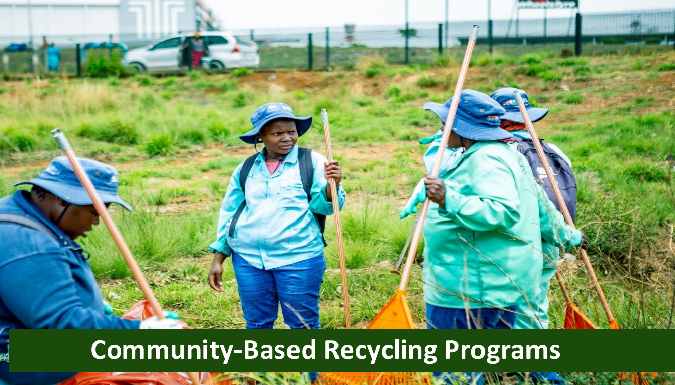
Community-Based Recycling Programs