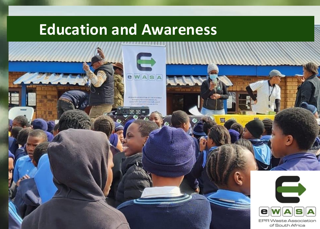
Education and Awareness