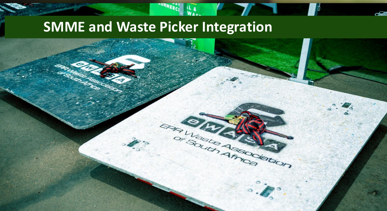
SMME and Waste Picker Integration